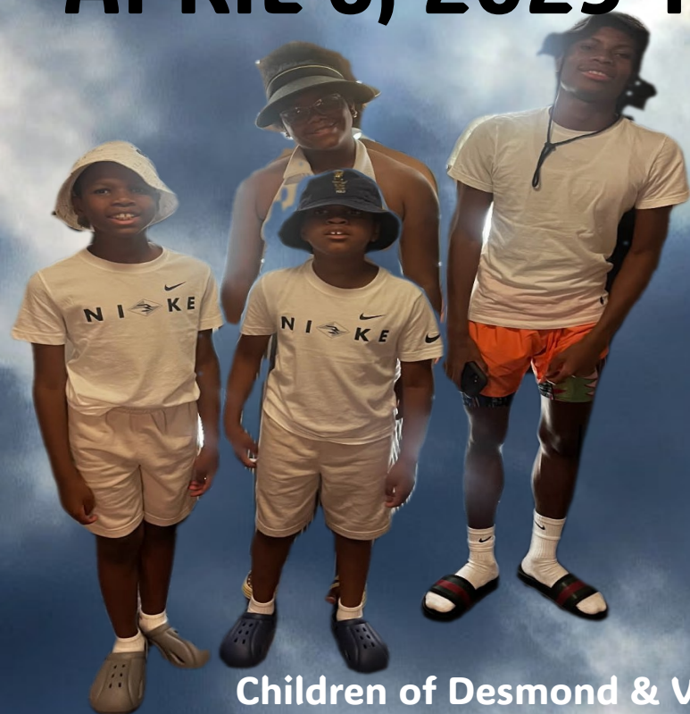
Children of Desmond & Virneal