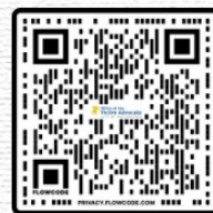
OVA Resource Guide